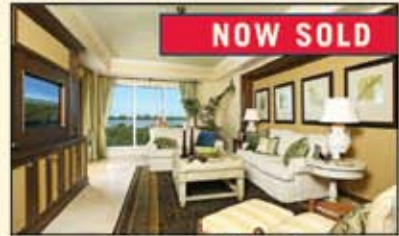
Azure #402 $1,795,000