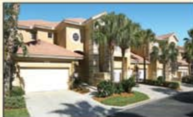
The Hamptons #201 $729,000