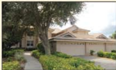
Waterford #204 $499,000 Turnkey