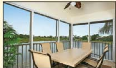
Lakeside #204 $599,000 Turnkey