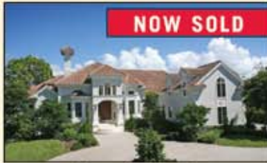
Bay Woods $2,400,000