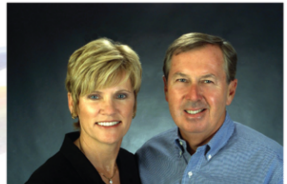
Bonita Bay Members Since 1998

For All Bonita Bay MLS Listings and Market Information Visit our Website