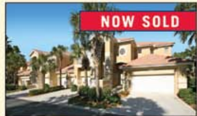
The Hamptons #201 $649,000