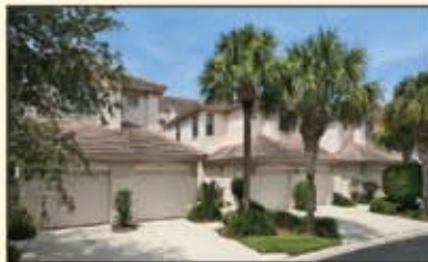
Harbor Landing #101 $299,000