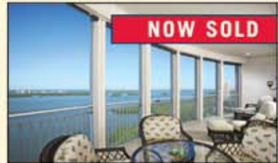
Horizons #1902 $1,580,000