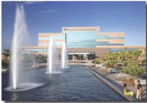
Physicians Regional-Pine Ridge 6101 Pine Ridge Road, Naples, FL 34119 239-348-4000