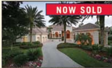
Bay Woods $3,600,000