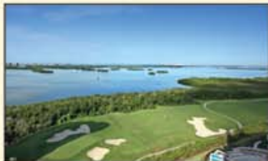
Esperia South #1701 $895,000